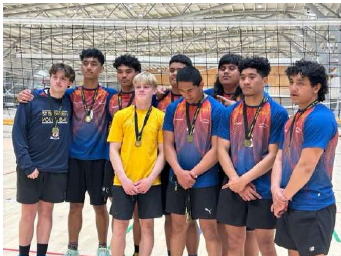
Senior Volleyball Premier Champions