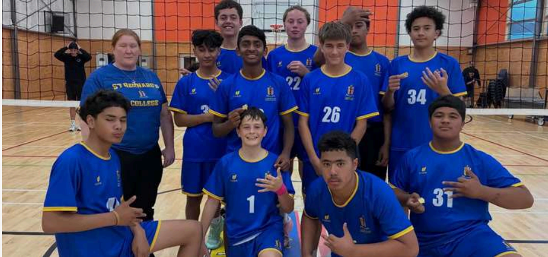
JUNIOR VOLLEYBALL WINNERS