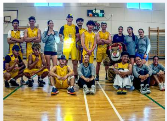
SBC VS SHC NETBALL