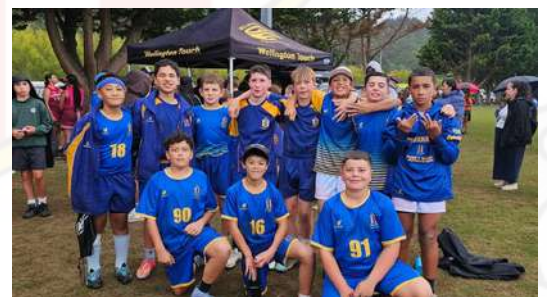
INTERMEDIATE TOUCH WINNERS