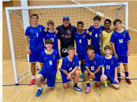
JUNIOR FUTSAL TEAM