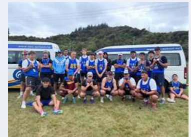
KI O RAHI