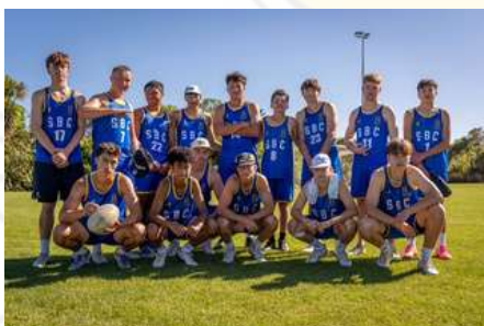
SENIOR TOUCH TEAM

Our Intermediates also impressed, fielding five teams this season. For the third year in a row (possibly longer), our Intermediate A team remains undefeated in the Total Touch competition — an outstanding achievement!