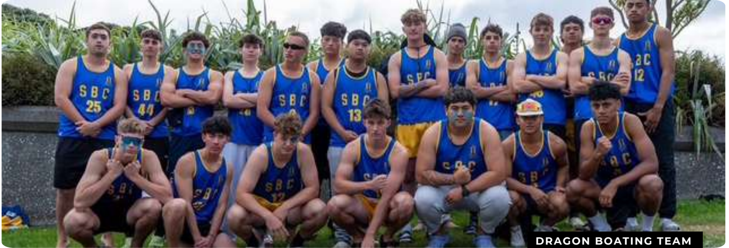
DRAGON BOATING TEAM