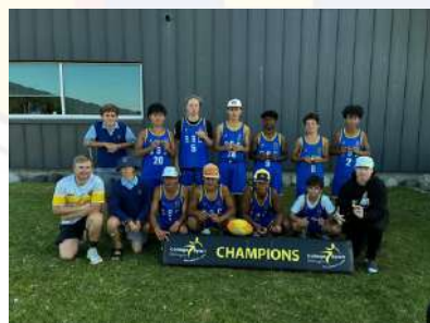
JUNIOR TOUCH WINNERS